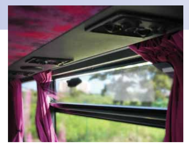
Hooper Windows (Australian made)

Its concise lines not only increase the aesthetic feeling but also enlarges the interior. Modern body design ensures easy access for repairing, therefore making maintenance faster and more convenient.