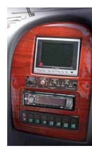
Radio / DVD Player with Microphone Arm